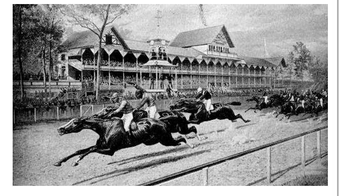
The Futurity at Sheepshead Bay Race Track, 1890's www.westland.net